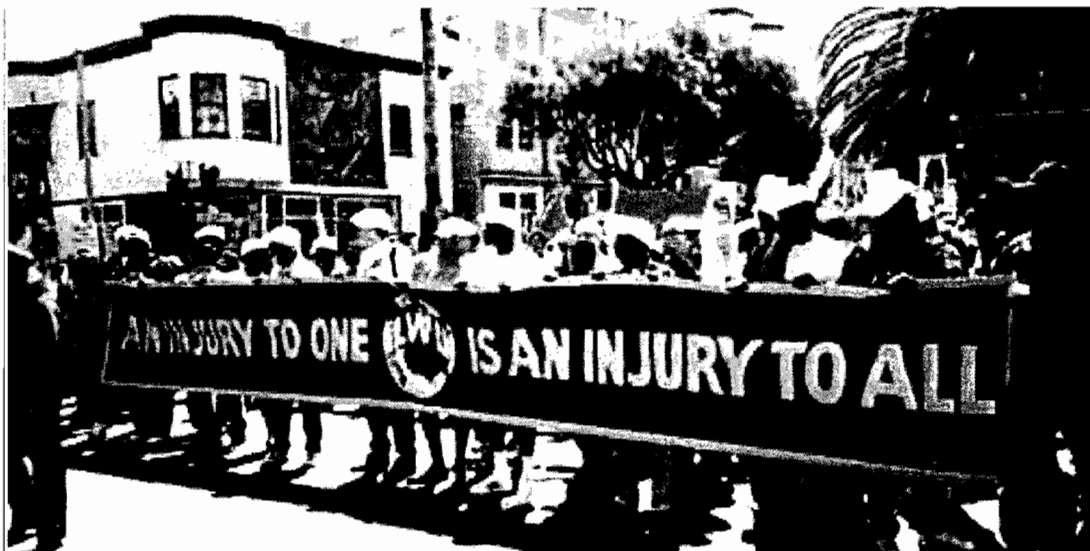
April 24, 1999: Longshore workers in the International Longshore and Warehouse Union (ILWU) shut all West Coast ports to free Mumia. Wearing traditional white caps, longshore workers formed up to lead a march in defense of Mumia in San Francisco, chanting "An injury to one is an injury to all! Free Mumia Abu-Jamal!"

But now, the Supreme Court has ordered the Third Circuit to reconsider this decision. They did so in light of their recent ruling on another case, Smith v Spisak . Having summarily tossed out Mumia's appeal against his